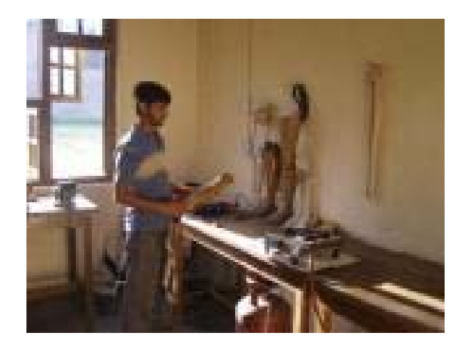
Repairing of limbs

Trust has an old vehicle and where-so-ever we get to know the plight of some poor person in remote villages, trust also tries to organize his/her pick-up from the village as well as drop back to his house.