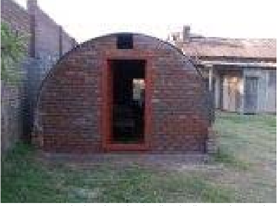
temporary shelter for physically challenged people

This helped us substantially to protect people during nights from tough weather conditions.