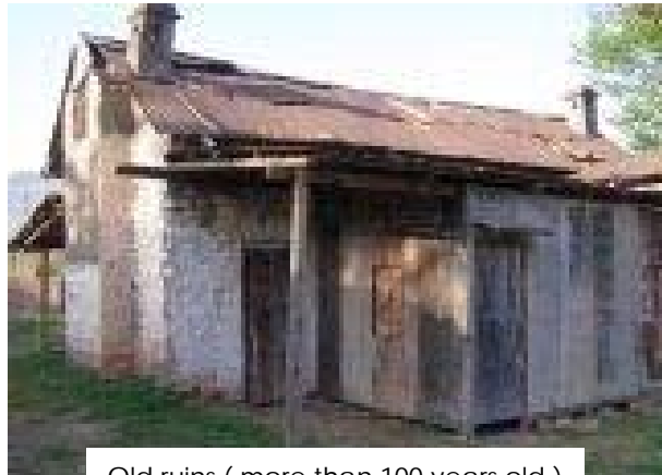
Old ruins ( more than 100 years old ) at Trust site

These ruins still exist. Only a part of land has been developed for limbs repairing center.