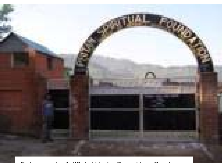
Entrance to Artificial Limbs Repairing Center

Therefore the challenge we had includes demolition of these ruins, levelling of land and construction of appropriate facilities for the welfare of handicapped and eye-patients.