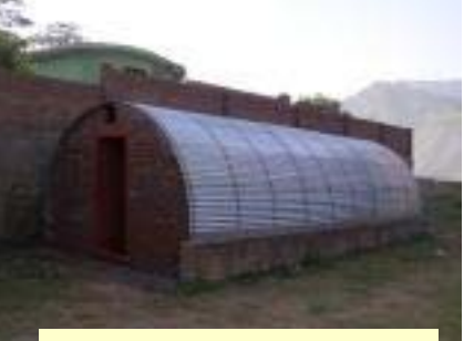
temporary shelter for physically challenged people

As this center became very popular and poor people started coming in frequently with hopes, we erected a temporary night stay shelter in shape of a hanger.