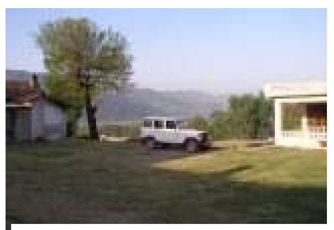
Old ruins, trust vehicle and limbs repairing center

Boundry wall on right side is just a temporary one right now and will be strengthened in phase 2.