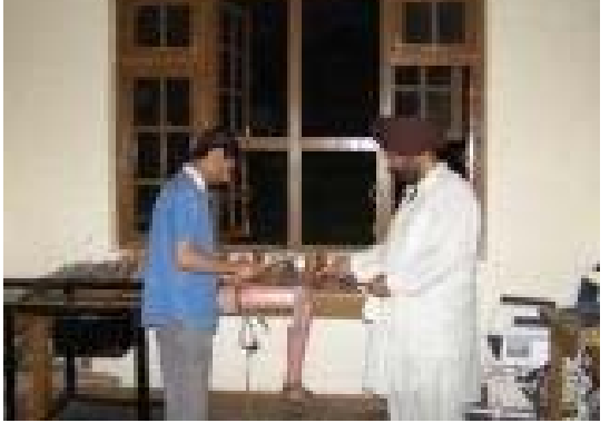
Satisfaction through renewed hope

Two physically challenged boys have been trained professionally for 6 weeks in Delhi by Bhagwan Mahaveer Viklang Sahayata Samiti. It is worth watching their dedication and commitment for serving other physically challenged people.